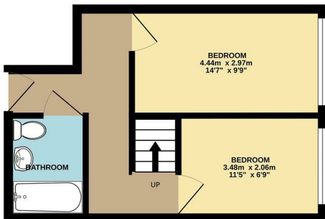
1ST FLOOR 21.6 sq.m. (232 sq.ft.) approx.